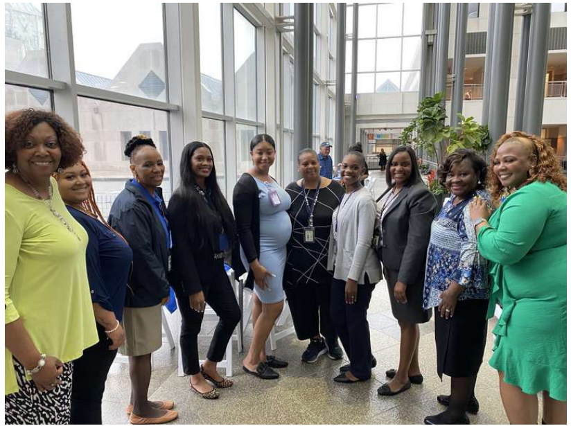
FCEA Retirees' Luncheon June 2024